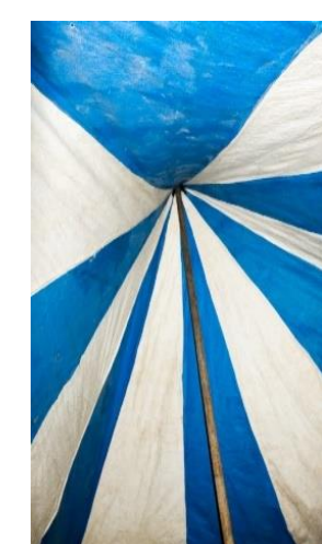
Allan Weber, Untitled, from the series Dance Day, 2021.

In Gallery 1 a series of football shirts , designed by Allan and worn by the football team are displayed. The shirts contain quotes in Portuguese from the bible and well-known proverbs. Alongside the shirts is a scarf designed by Allan, produced especially for the exhibition. Created with Art of Football, a Nottingham design company, the scarfs are available to buy in our shop. The scarf contains the phrase 'Nenhum lugar do mundo é igual nosso lugar no mundo' / 'no place in the world is like our place in the world.'