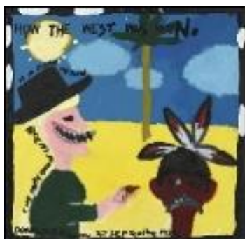
How the West was Won , 1982

Large, cartoon-like painting depicting violence. Contains racist language , including the phrase 'THE ONLY GOOD INJUN IS A DEAD INJUN'.