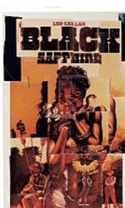
Black Sapphire , 1990

Collages made from pulp fiction book covers that feature racist sexualised imagery and stereotypes .