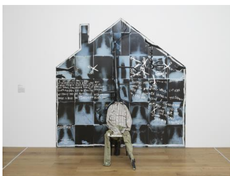
The House that Jack Built , 1987

Large installation referencing racial violence , with imagery that suggests lynchings. It also contains racist language , including the N-word.