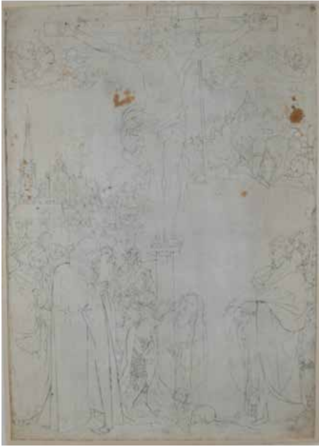
Albrecht Dürer (1471–1528), The Crucifixion (date unknown)