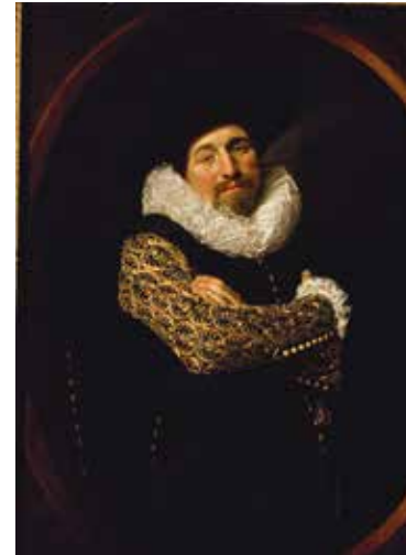
Franz Hals, Portrait of a man. 1622.

Gallery 2 offers a more intimate reflection on the Chatsworth collection, perhaps suggesting a fantasy Ducal apartment. It contains Franz Hals' Portrait of a Man (1622). With his warm, direct gaze, the sitter could be Isaac Abrahamsz Massa, a Russian trader who was Franz Hals' friend. The decoration of the late 17th century chest beneath it echoes the rich embroidery of his sleeves. His ruff is echoed by the lace cravat by Grinling Gibbons, whose carvings can be seen in St Paul's Cathedral, Windsor Castle and Hampton Court.