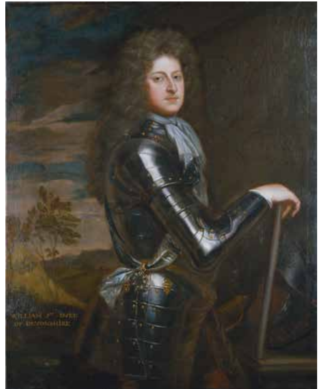
Sir Godfrey Kneller, Portrait of William Cavendish, First Duke of Devonshire, c.1680