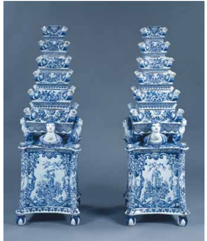
Adriaen Kocks (d.1701) Delft flower pyramids, date unknown © Devonshire Collection, Chatsworth

Pablo Bronstein and The Treasures of Chatsworth continues at Chatsworth with a survey of Bronstein's drawings in the New Gallery, together with a new drawing created for the Old Masters Drawing Cabinet.