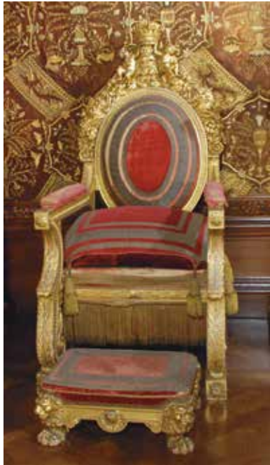
Coronation chair of Queen Adelaide. 1830

Gallery 1 also contains the coronation chairs of William IV and Queen Adelaide, which were actually hand-me-downs from George IV - William was keen to appear frugal in comparison with his notoriously extravagant predecessor. The 6th Duke of Devonshire, at that time Lord Chamberlain, claimed them after the coronation in 1831 as one of the rights of his office.