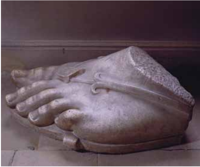
Foot Wearing a Sandal, Roman (Antique) Marble. BC 150 - BC 50.