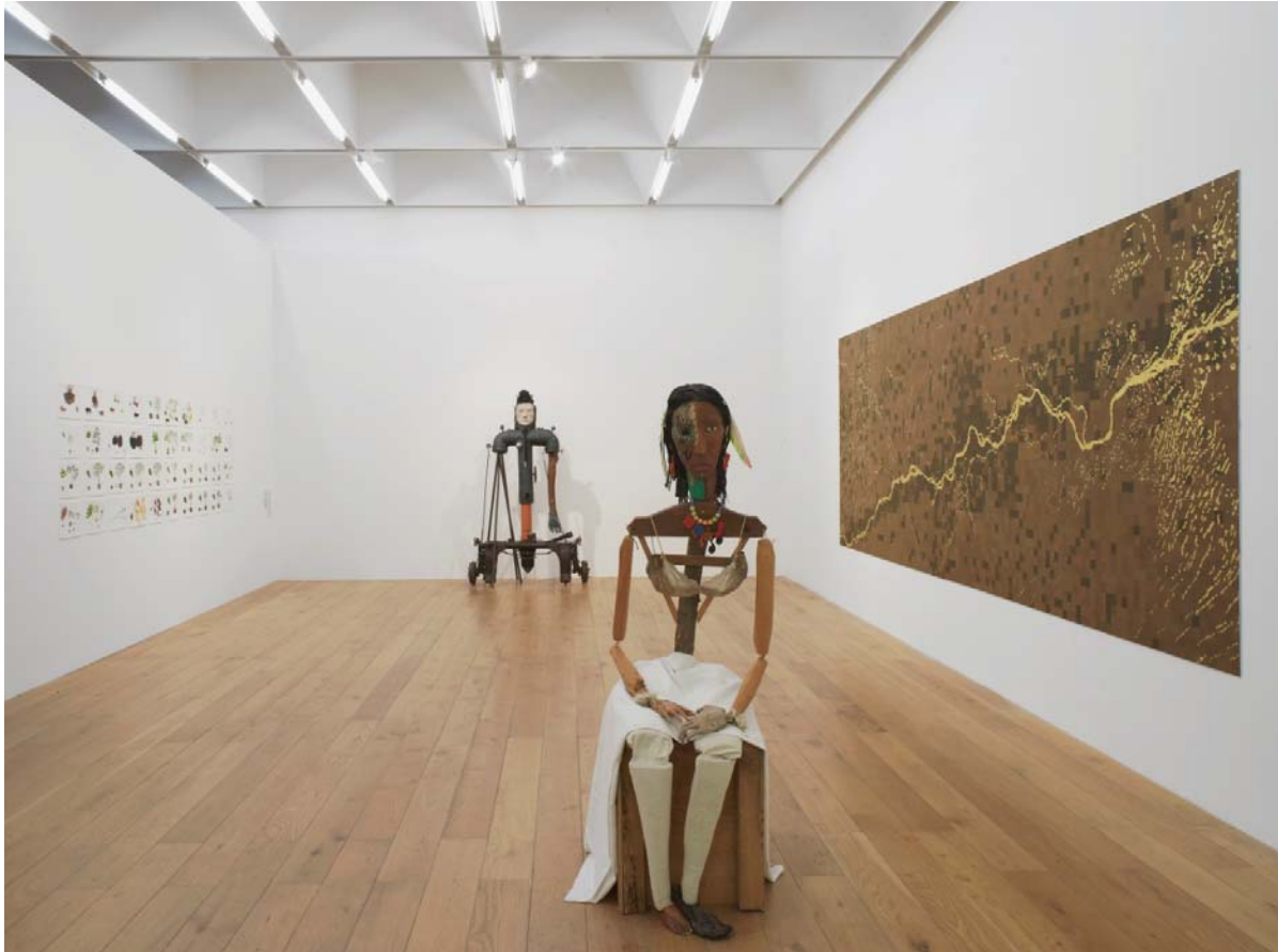
Fig.4: Installation view, Rights of Nature , Nottingham Contemporary. Jimmie Durham, La Malinche , 1988–1991; with Cortez, 1991 (background); with Miguel Angel Rojas, El Nuevo Dorado (The New Eldorado), 2012 (on wall to right); and Abel Rodriguez, The plants cultivated by the people from the center in the Colombian Amazon , 2012 (on wall to left)

In a third gallery, the sculpture of Native American expat Jimmie Durham presents portraits of La Malinche, referencing the native Nahua translator, intermediary, and lover of the Spanish Conquistador Hernán Cortés, who is depicted in a nearby work. Composed of reused metal piping, natural elements, and plastic kitsch, these pieces' very heterogeneity allegorizes intercultural conflict, colonial domination, and treacherous intercultural negotiation. Nearby is the mural of Colombian artist Miguel Angel Rojas, showing the colonization of nature, where square sections of powdered coca leaves display the topography of the Amazon River delineated in gold leaf. Conjugating materiality and form, the piece translates how this biodiverse habitat suffers informal drug-related coca farming and gold mining. Meanwhile, Abel Rodríguez, of the Nonuya people of Colombia's Amazon rainforest, creates detailed drawings of his native flora and fauna, regenerating his people's traditional biological environmental literacy as a counter to the logic of commercial exploitation. Durham's is a critical allegory of postcolonial Indigeneity-in-process, precarious and resistant, irreducible to contemporary forms of exoticism and objectification; Rojas's is one of cultural revival based in a eco-ethnic knowledge of local nonhuman life.