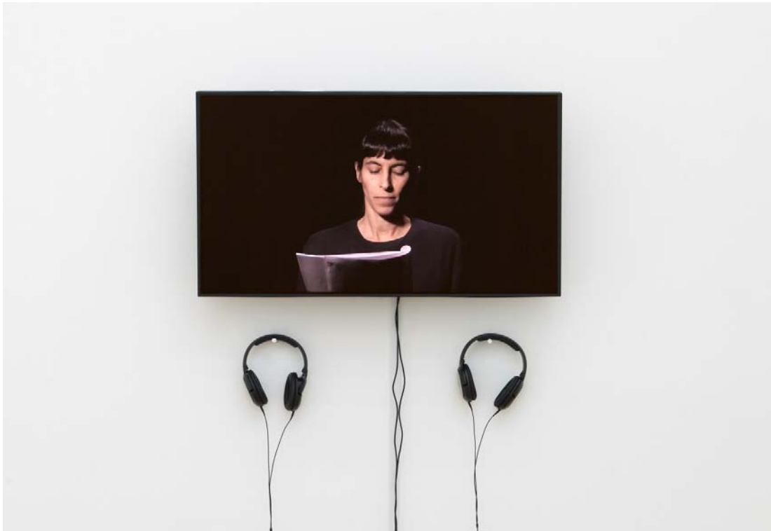
Fig.7: Installation view, Rights of Nature , Nottingham Contemporary. Amy Balkin, Reading the IPCC Fifth Assessment Synthesis Report: Approved Summary for Policymakers , Remade for 2014 (previously 2008), Video, colour, sound, 38 min 53