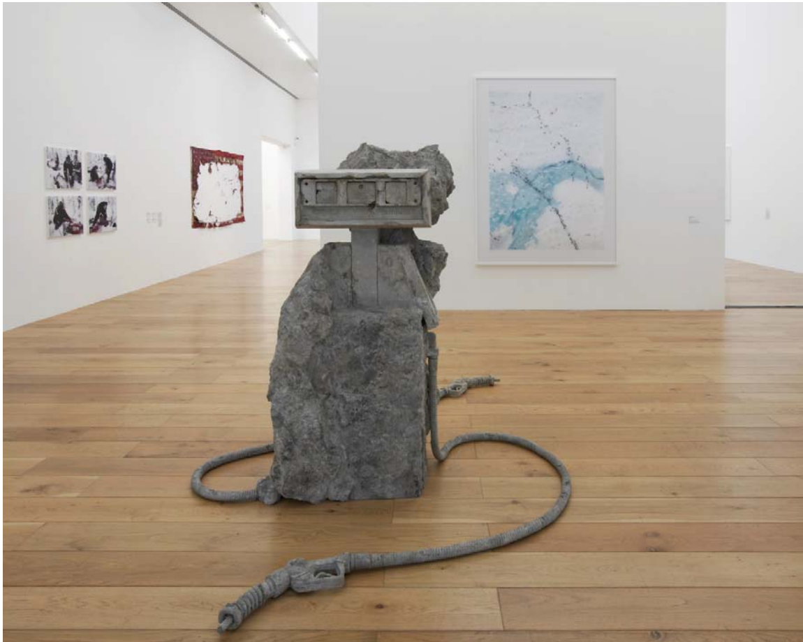
Fig. 1: Installation view, Rights of Nature , Nottingham Contemporary. Allora & Calzadilla, 2 Hose Petrified Petrol Pump , 2012 (foreground); Subhankar Banerjee, Caribou Migration I , 2001 (background)

In the exhibition, the icy-blue photographs of Subhankar Banerjee show the majestic mountains and snowy expanses of Alaska’s Arctic National Wildlife Refuge, an area riven by conflict between Indigenous Gwich’in people and oil-drilling interests. While corporate-friendly politicians position the Arctic as a vast white nothingness unthreatened by proposed development, Banerjee’s images, populated with Caribou migrations, dramatize the fragile biodiversity of this ecosystem, even while it remains distinct in his work from the “wilderness” used historically by conservationists to dispossess Indigenous peoples of their rights to hunt on such lands. Nearby in the gallery is the petrified Petrol Pump of Allora & Calzadilla, where the ubiquitous fossil-fuel technology has itself been fossilized, appearing as if a frozen totem delivered to us from a post-carbon future. It figures as a hopeful sign that the nature appearing in Banerjee’s imposing portrayals will ultimately overcome the industrial threats to its “right to regenerate its bio-capacity and to continue its vital cycles and processes free from human disruptions,” as the Universal Declaration of the Rights of Mother Earth defines it.