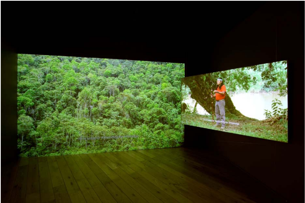
Fig. 2: Installation view, Rights of Nature , Nottingham Contemporary. Ursula Biemann & Paulo Tavares, Forest Law , 2014, Video installation, 41 min 52