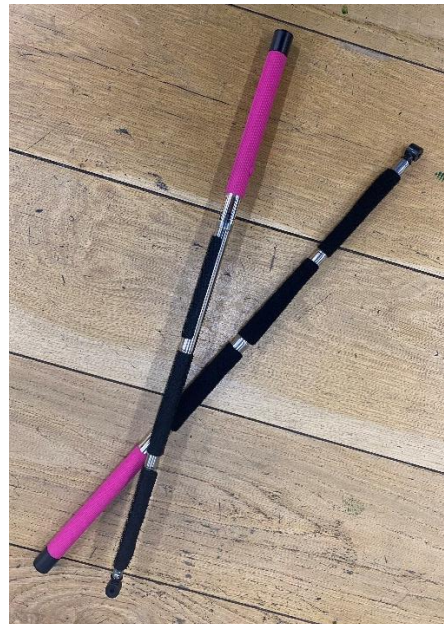
2 x Selfie sticks