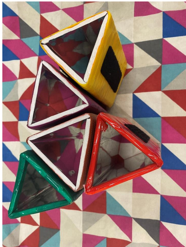
5 x Small Kaleidoscopes