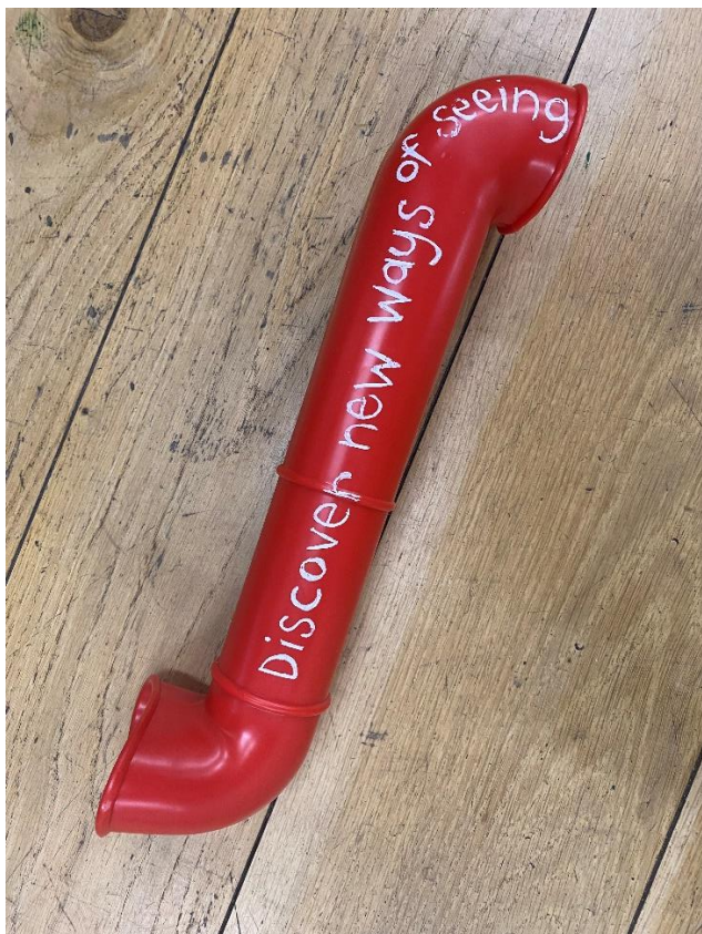
1 x Periscope