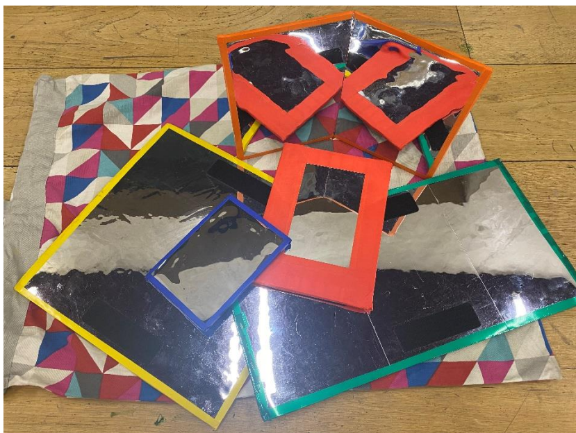
6 x Card mirror pieces