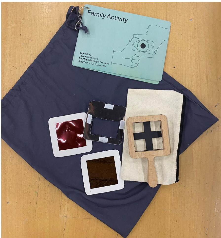
Each calico zippered bag (x 5): 1 x Wooden view finder with handle Various velcro card shapes with different dividers