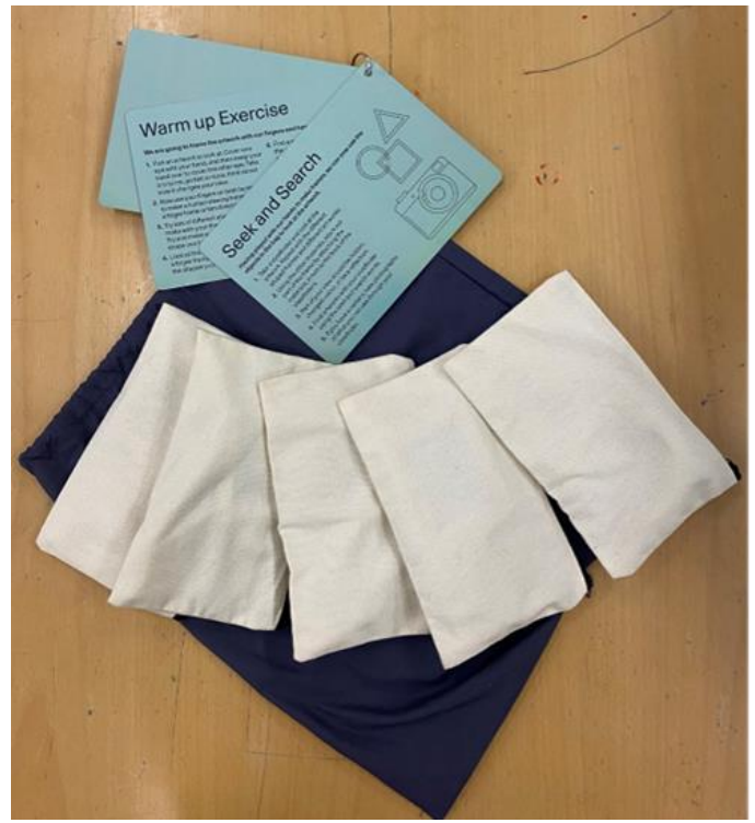
5 x Calico small (pencil case) zippered bags